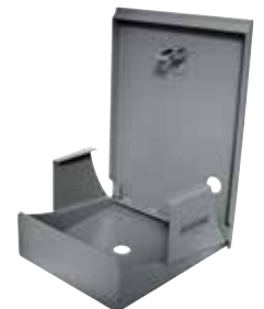
Table top secure mount for flat surfaces