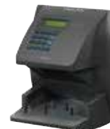
Standard Reader comes with surface wall mount bracket

Schlage offers options to ensure that the HandKey can be mounted in a manner appropriate for your application.